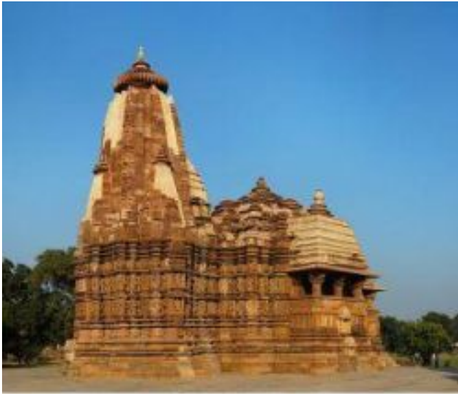
© Marcin Bialek, Devi Jagadambi Temple

If ever there is a tiny black mole, a near-perfect beauty spot on the pout of time that heightens its allure, then surely that is the ancient temple town of Khajuraho.